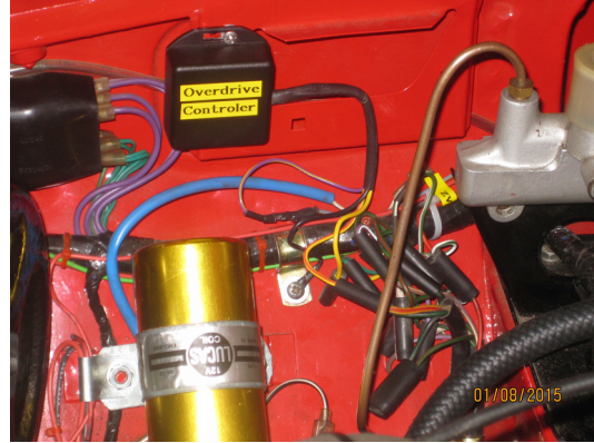
ODC wired in series.