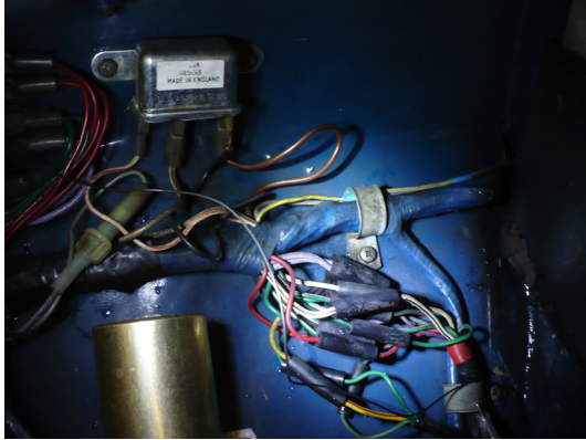
Original wiring: Yellow wire connected to yellow/red wire

As the yellow wire from the OD switch is routed into the engine compartment and there connected by a bullet connector to the yellow/red wire going to the gear box switch, the ODC can be installed nearby and wired without changing the original connectors. Therefore it is a matter of seconds to change back.